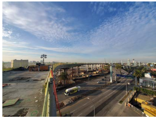
Views of the completed guideway over Century Blvd.

Work also continues this month with a focus on guideway work over Sepulveda Boulevard. Additionally, construction is taking place on multiple pedestrian walkways, including the walkway connecting Terminal 2 to the future Center Central Terminal Area (CTA) station, as well as the walkway connecting Terminals 4 and 5 to the future West CTA station. Lastly, the first of four steel sections for the pedestrian bridge at Terminal 3 was successfully placed in mid-January.